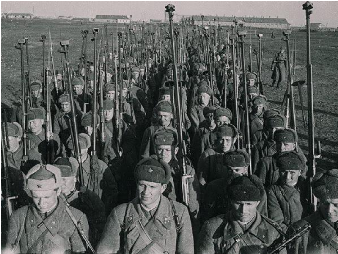
Figure 1. A WWII Soviet antitank rifle unit (note the size of the weapons).

In the case of very large values of C compared to M_p , which must imply a very high muzzle velocity weapon and cartridge system, and for the weapon to be able to recoil forward as asserted by both Corner (1950) and Schmidt (1973) for high-efficiency muzzle brakes, k must clearly be negative. So there is a lot of room for discussion about the appropriate value for k ; clearly, it depends on many factors, including the weapon one is discussing, and, in particular, about the design of the muzzle brake. Figures 1 and 2 illustrate the size of some of these guns—in this case, some of the Soviet 14.5-mm antitank rifles. (Note the very large muzzle brake.)