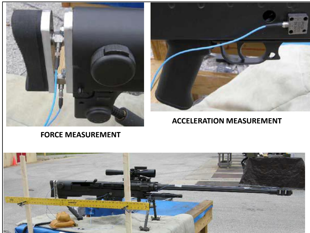
Figure 3. Experimental arrangement to make force measurements during firing based on the Steyr AMR.