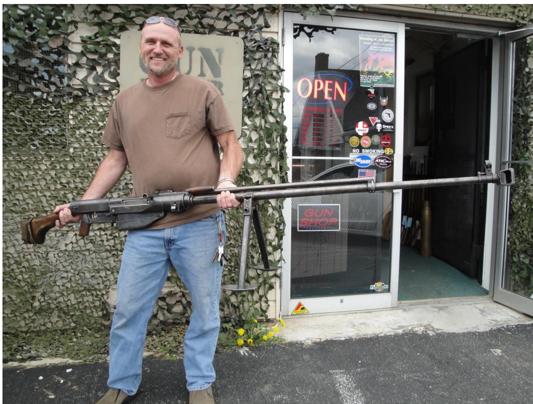
Figure 2. The Soviet gas-operated, semiautomatic 14.5-mm PTRS antitank rifle in detail.