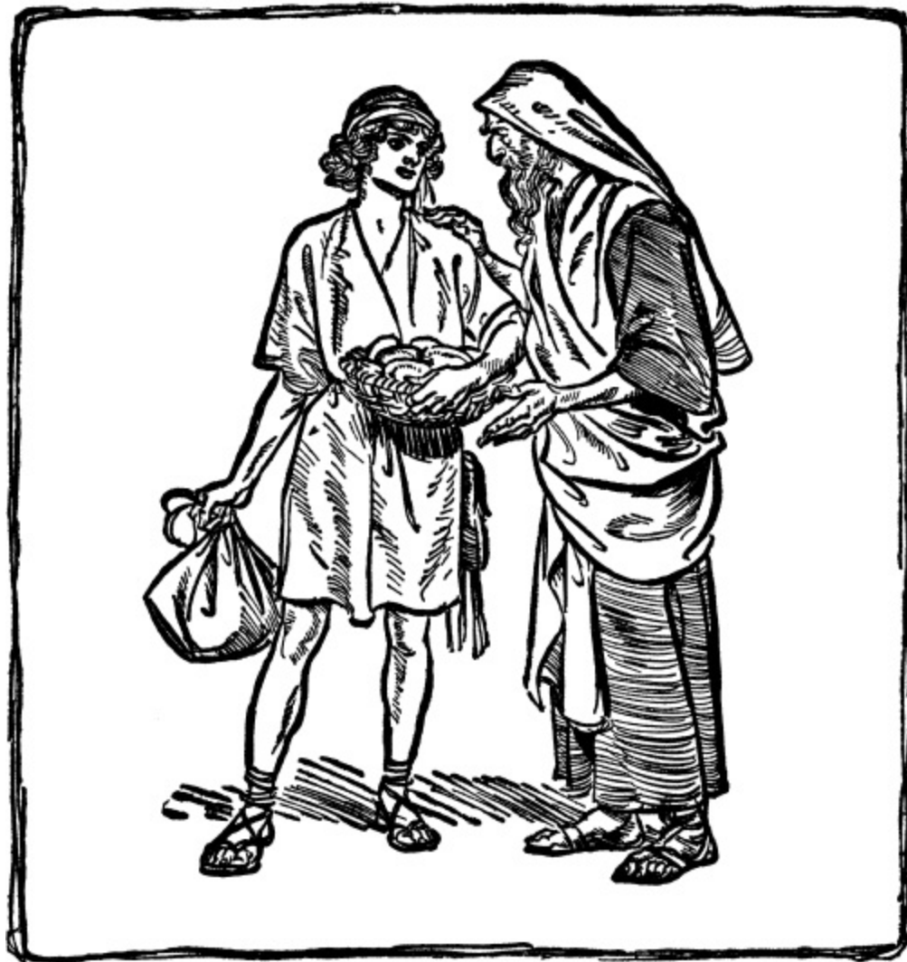
Jesse sends David to the camp.

On either side of a narrow valley, divided by a stream which ran along over smooth stones, the two armies faced each other. There they were encamped, like wild beasts ready to fly at each other's throats. At any moment the fight might begin, and that stream be stained red with blood. Only the Philistines were far the strongest, and the Israelites had but little chance of victory.