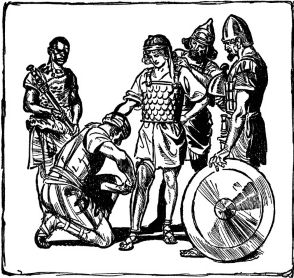
Saul puts his own armour on David.

It was not in his own strength that he trusted. “The Lord that delivered me out of the paw of the lion and out of the paw of the bear, He will deliver me out of the hand of this Philistine,” he ended triumphantly.