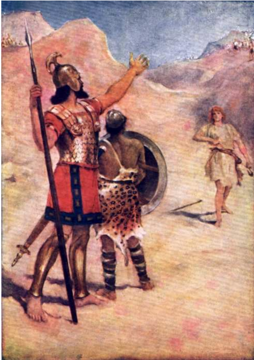
David's fight with Goliath.