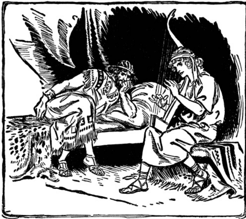
David drew magic music from his harp's strings.

Saul listened to their words, and hope crept into his heart.