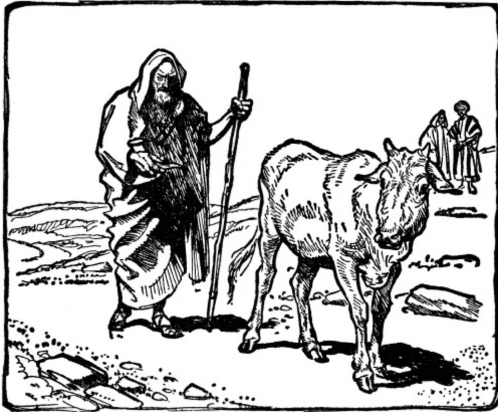
An old feeble man was slowly climbing up towards the town.

But the people whispered together that the old man was none other than Samuel, the prophet of the Lord, who carried God's messages. He must be bringing a message to them, and who knew if it was good or evil. They tried with uneasy minds to remember if they had been doing anything wrong of late as they watched the old man drawing nearer and nearer. Then at last the chief men of the town went out to meet him.