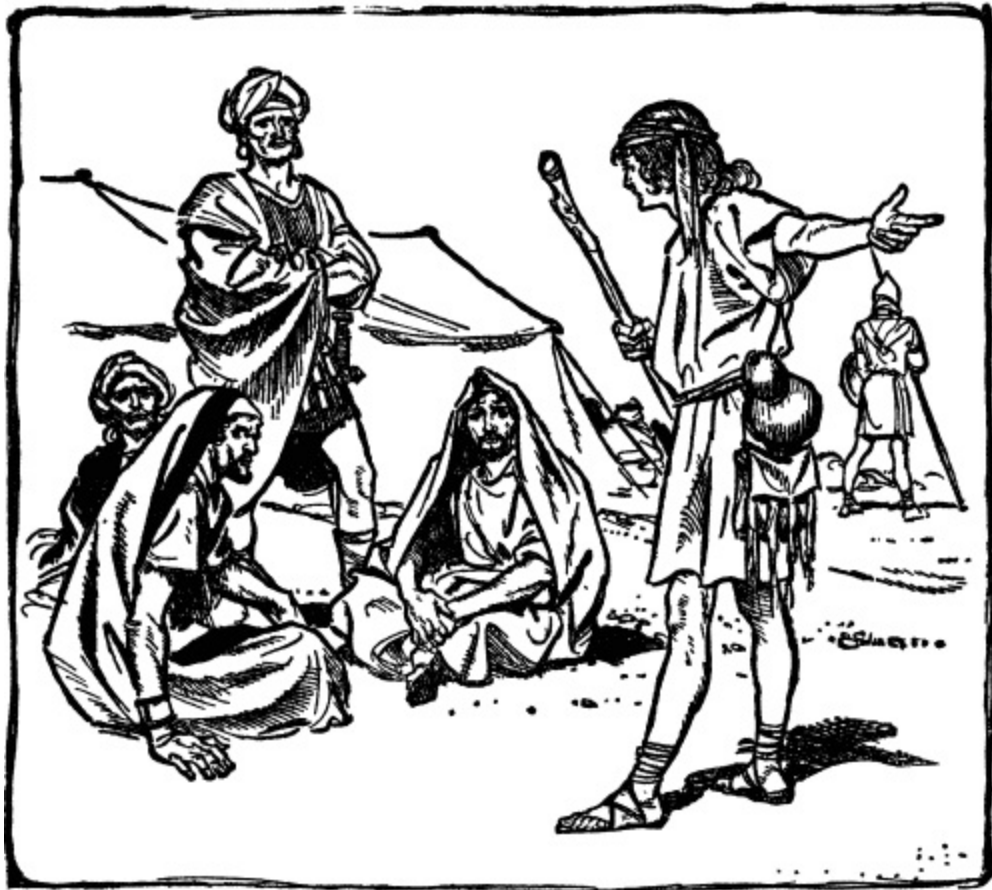
Eagerly David began to ask them what it meant.

But even while he spoke there was a stir among the Philistines, and all eyes were turned to watch, all ears were strained to hear the enemy's challenge, which rang out clearly across the narrow valley.