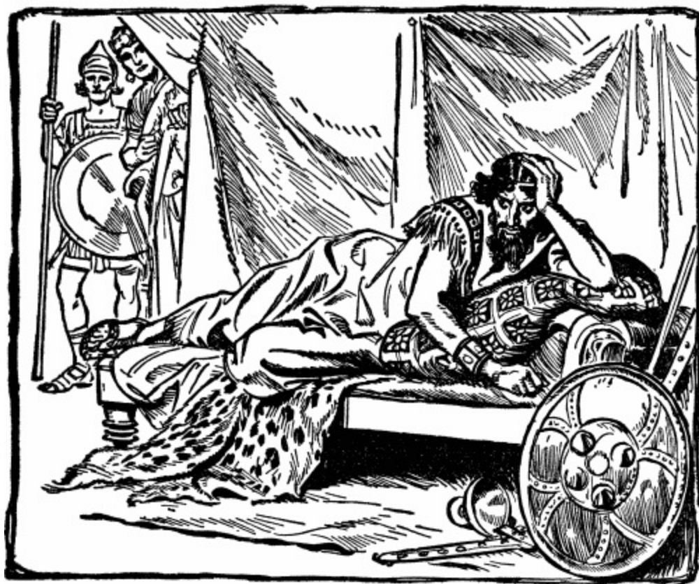
Saul sat day after day in his darkened tent.

Saul, the King of Israel, sat day after day in his darkened tent ill and full of misery. No one dared to go near him, and his servants whispered together, “It is an evil spirit from the Lord that troubles him.”