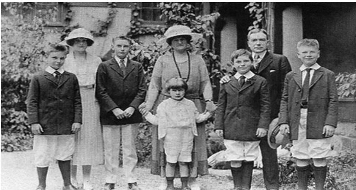
BLACK NOBILITY TERROR

The rise of the Rockefeller family was made possible from two angles by the Rothschilds. One was by the large subsidies placed on transports of Rockefeller oil. The documents of the American trade register prove that the Rothschilds, since 1896, have owned ninety-six percent of the American railways. This made it possible to transport oil on rail. When John D. Rockefeller wanted to expand, he received the financial support he needed to do so from the Rothschilds through their National City Bank of Cleveland. In exchange, the Rockefellers had to transport their oil via the Rothschilds railways. An illegal agreement saw to it that the Rockefellers received a bonus for the amount of oil they transported by train. Because of this agreement nobody could compete with the Rothschilds in transporting Rockefeller oil. This was all arranged by Jacob Schiff, of the company Kuhn & Loeb, the brain behind the foundation of the Rockefeller imperium.